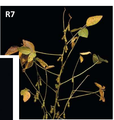
Beginning maturity (above)